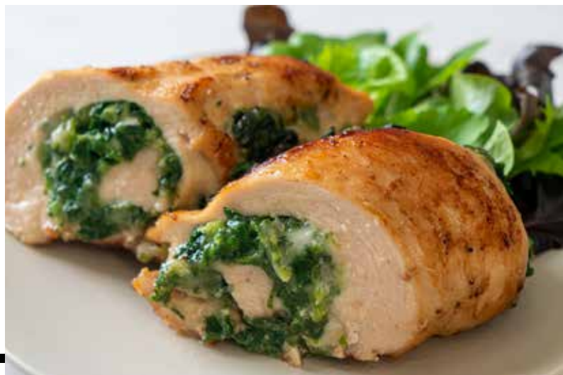
Y5004 | Chicken Florentine Roll