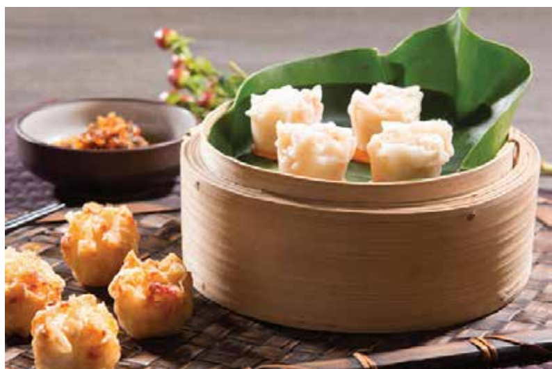
M9040 | Shaomai – Shrimp and Vegetable