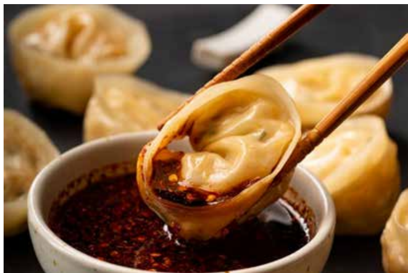
D1090 | Chicken Wonton