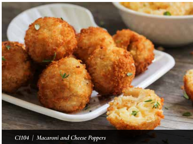
C1104 | Macaroni and Cheese Poppers