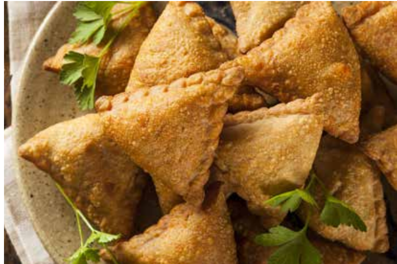
RAJF251 | Indian Samosa with Spiced Potato and Green Peas