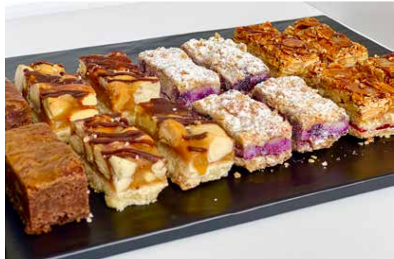
M9372 | Mini Dessert Bar Assortment