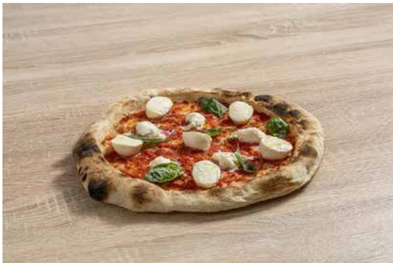
BG3945 | Vesuvio Pizza Crust (12") – Neapolitan