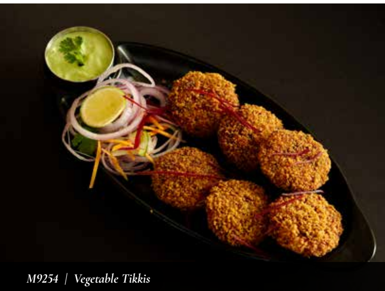
M9254 | Vegetable Tikkis