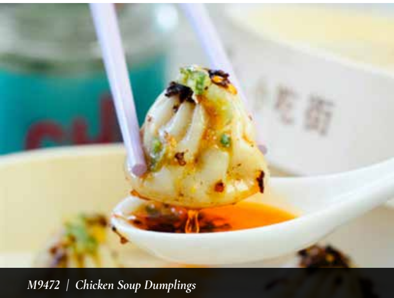
M9472 | Chicken Soup Dumplings