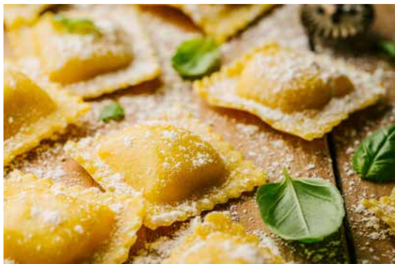
ML8621 | Short Rib and Aromatic Vegetable Ravioli