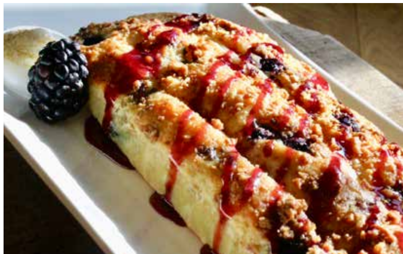
P2006 | Buttermilk Breakfast Tart Stuffed with Fresh Blueberries and Granola