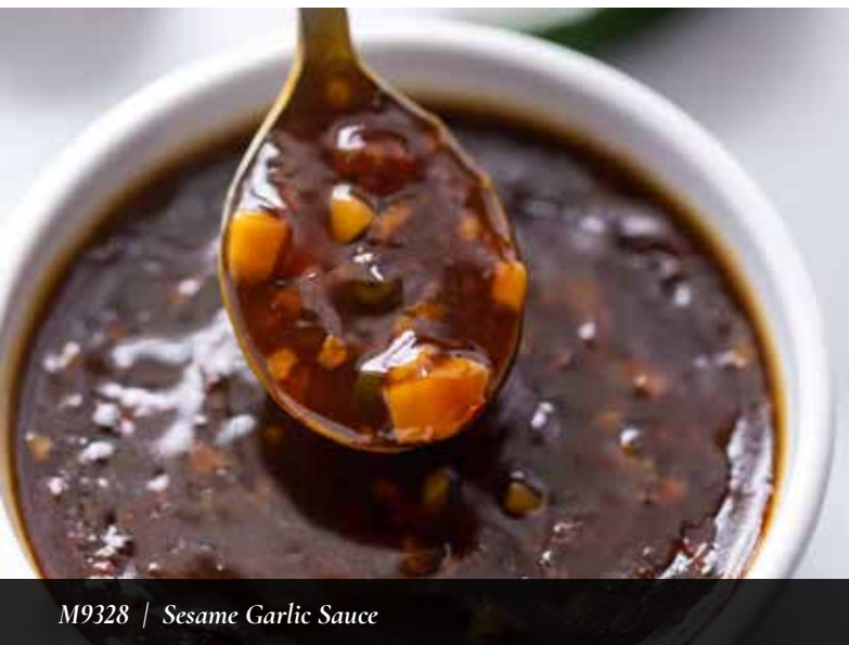
M9328 | Sesame Garlic Sauce