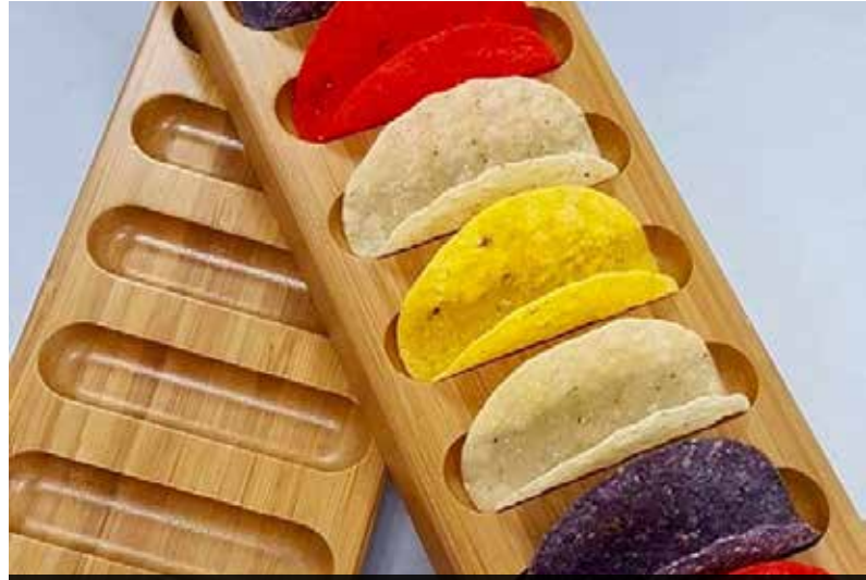
M9230 | Assorted Mini Taco Shells