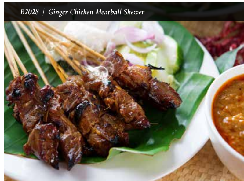
B2028 | Ginger Chicken Meatball Skewer