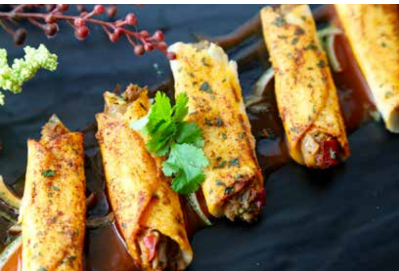
B2256 | Beef Barbacoa Taquito