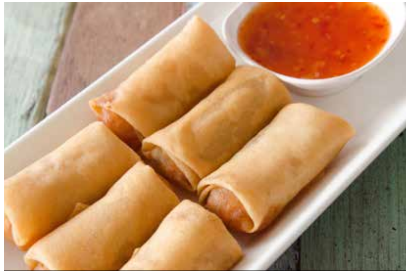
I1044 | Buffalo Chicken Spring Roll