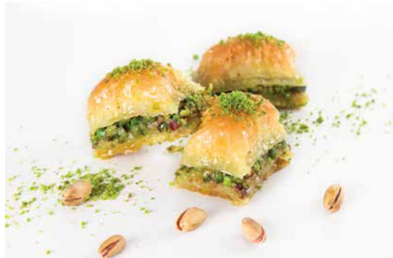
D1096 | Pistachio Baklava