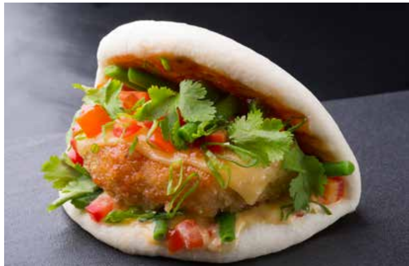
M9234 | Plain Folded Bao Buns