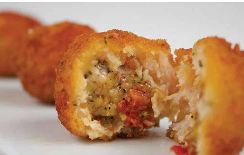
C2004 | Chicken Fontina Bites with Fontina Cheese and Sundried Tomatoes