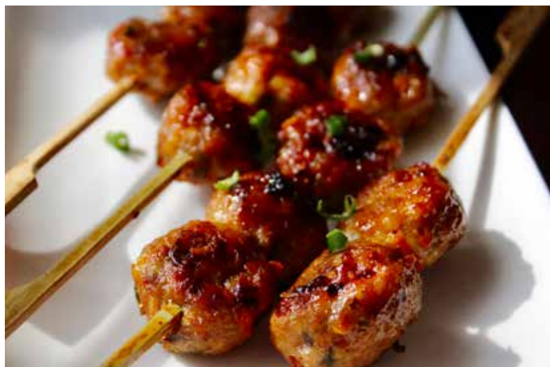
C2456 | Ginger Chicken Meatball Skewer