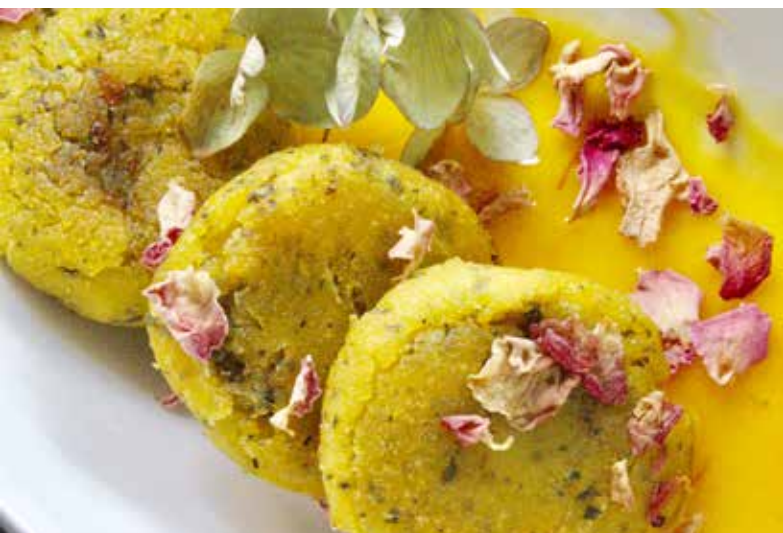
V2274 | Green Chili Arepas