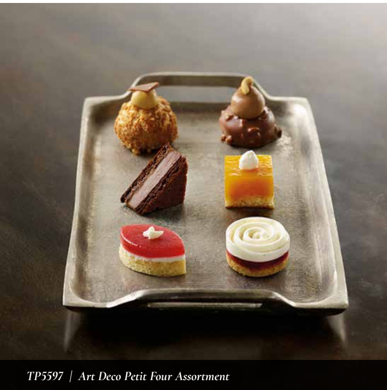
TP5597 | Art Deco Petit Four Assortment