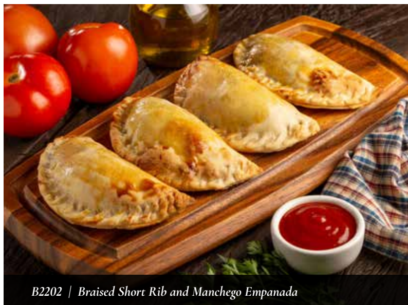
B2202 | Braised Short Rib and Manchego Empanada