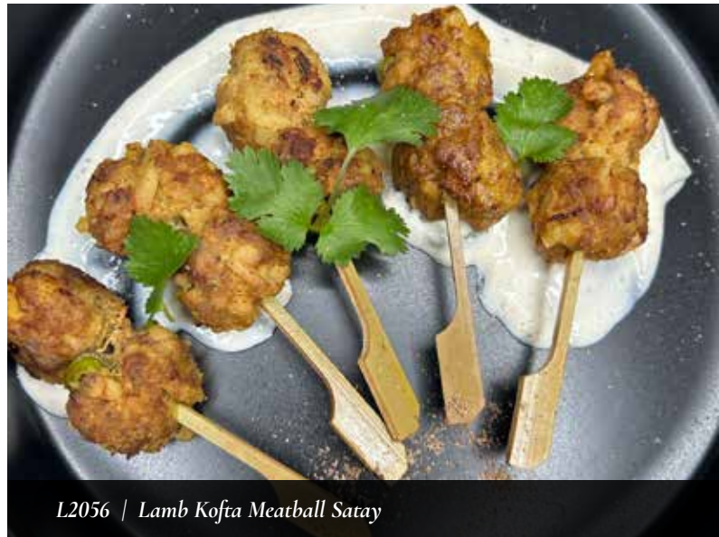
L2056 | Lamb Kofta Meatball Satay