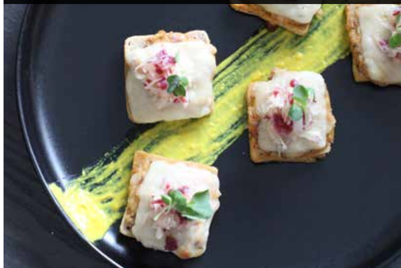
B2034 | Open Faced Reuben Sandwich