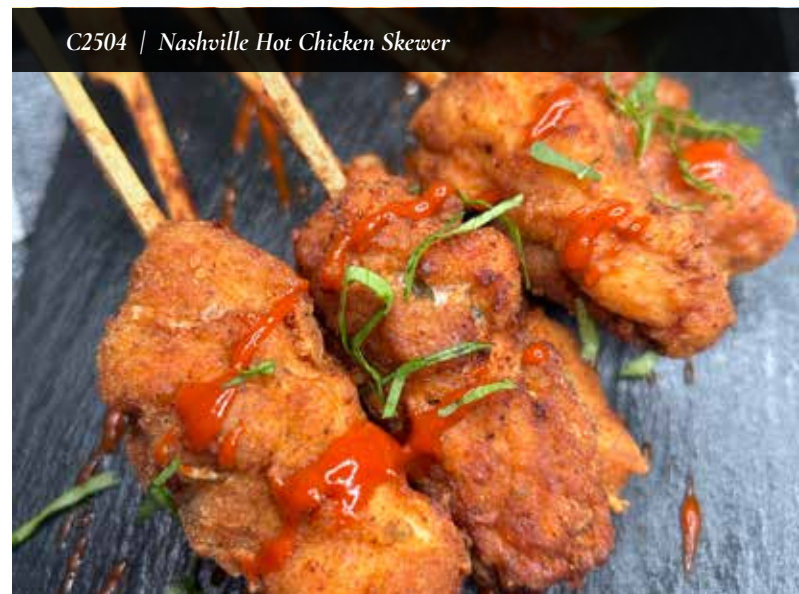
C2504 | Nashville Hot Chicken Skewer