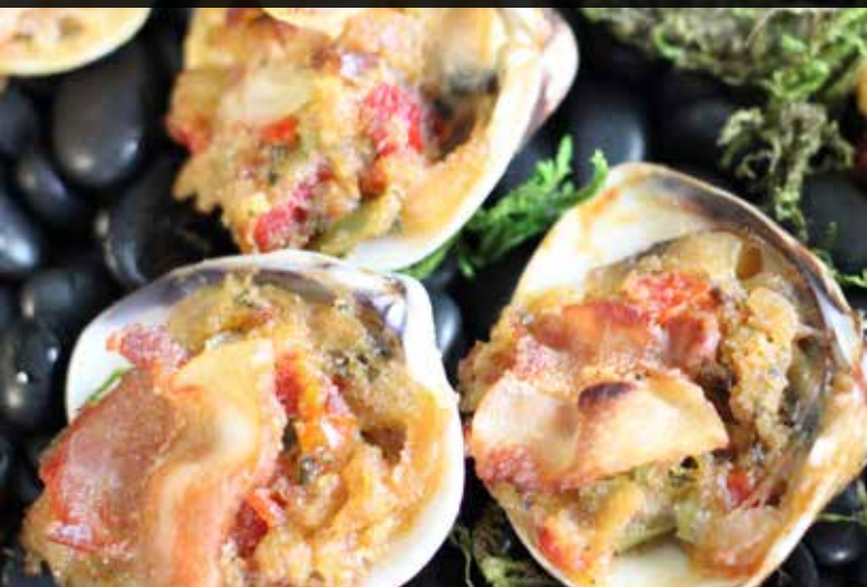
C3002 | Clams Casino on the Half Shell