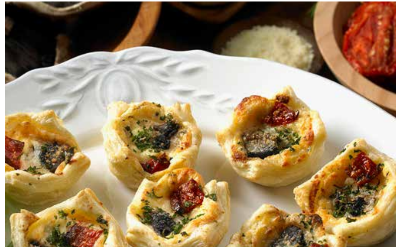
M1046 | Bella Flora Puff with Portabella Mushrooms and Ricotta Cheese