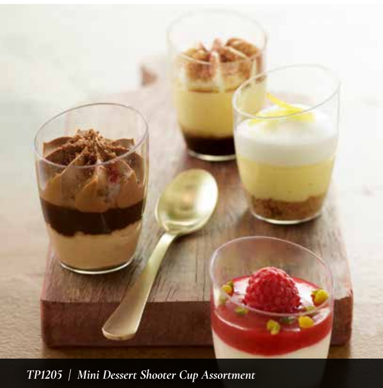
TP1205 | Mini Dessert Shooter Cup Assortment