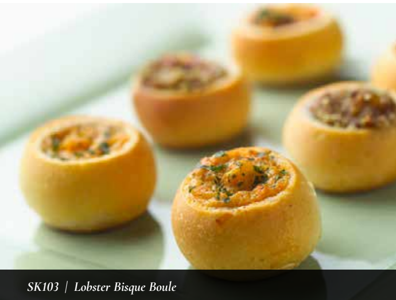
SK103 | Lobster Bisque Boule