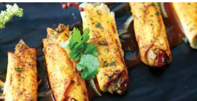
B2256 | Beef Barbacoa Taquito