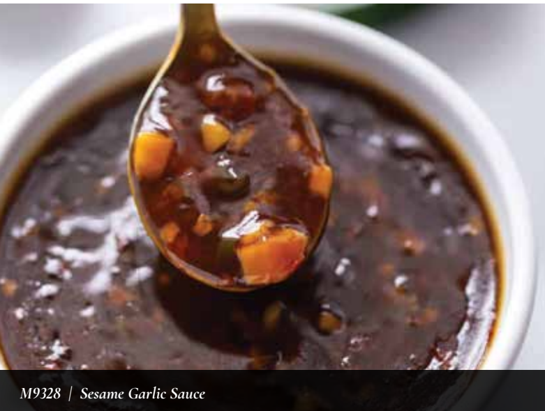
M9328 | Sesame Garlic Sauce