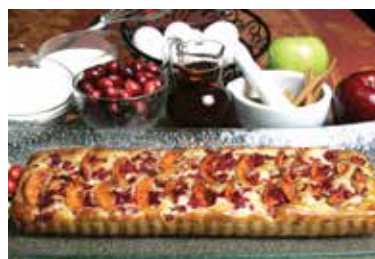
P2004 | Breakfast Tart Stuffed with Fresh Cranberries and Apples