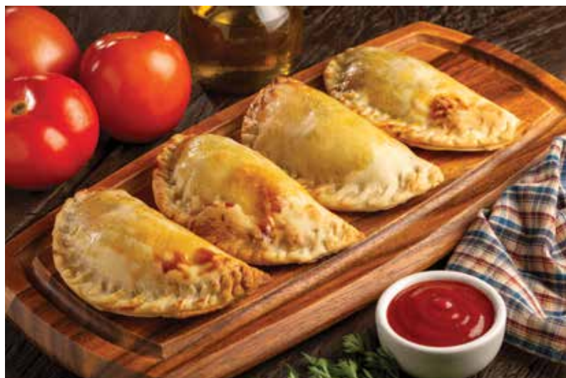
B2202 | Braised Short Rib and Manchego Empanada