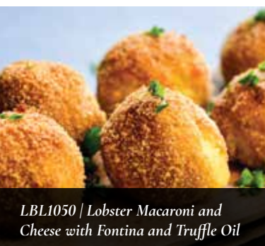
LBL1050 | Lobster Macaroni and Cheese with Fontina and Truffle Oil