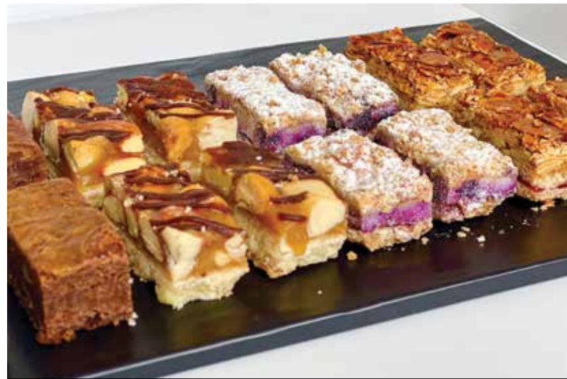
M9372 | Mini Dessert Bar Assortment