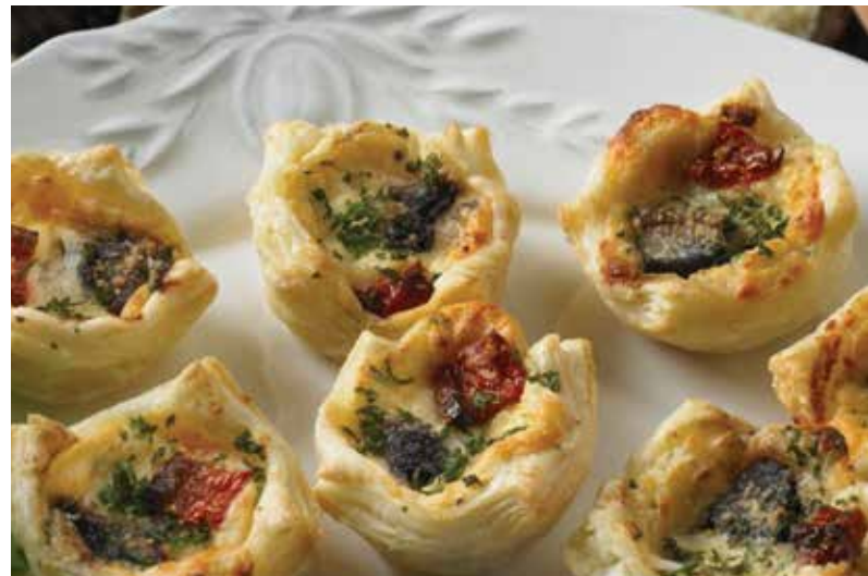
M1046 | Bella Flora Puff with Portabella Mushrooms and Ricotta Cheese