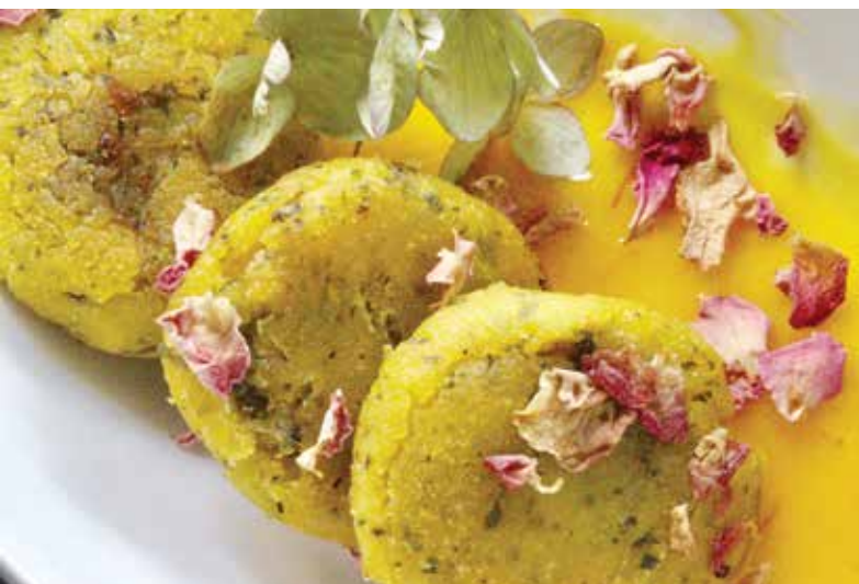
V2274 | Vegan Green Chili Arepas