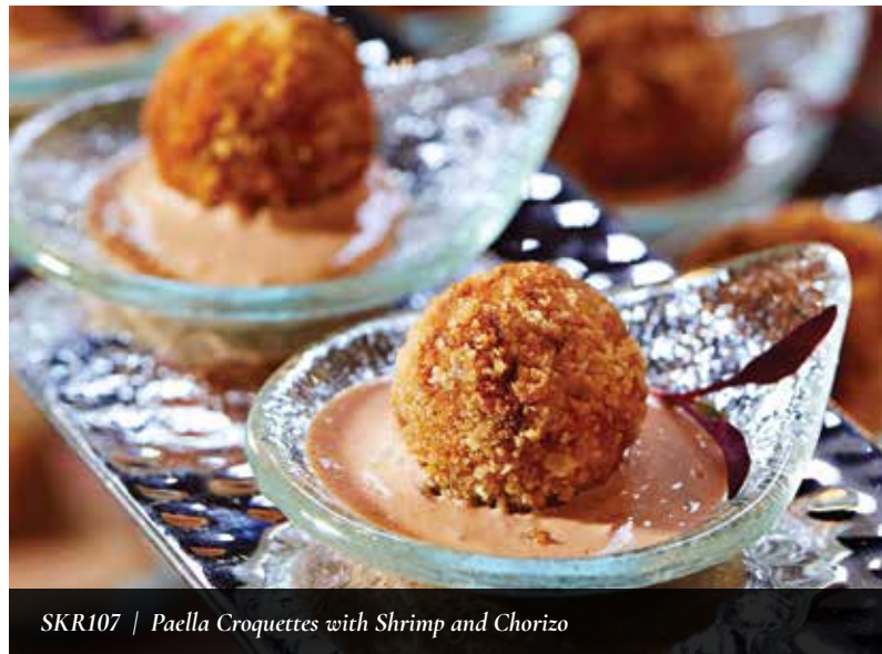
SKR107 | Paella Croquettes with Shrimp and Chorizo