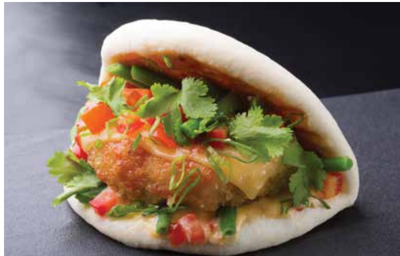
M9324 | Plain Folded Bao Buns