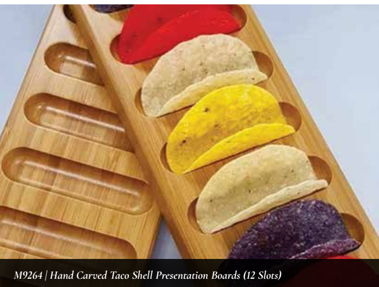
M9264 | Hand Carved Taco Shell Presentation Boards (12 Slots)