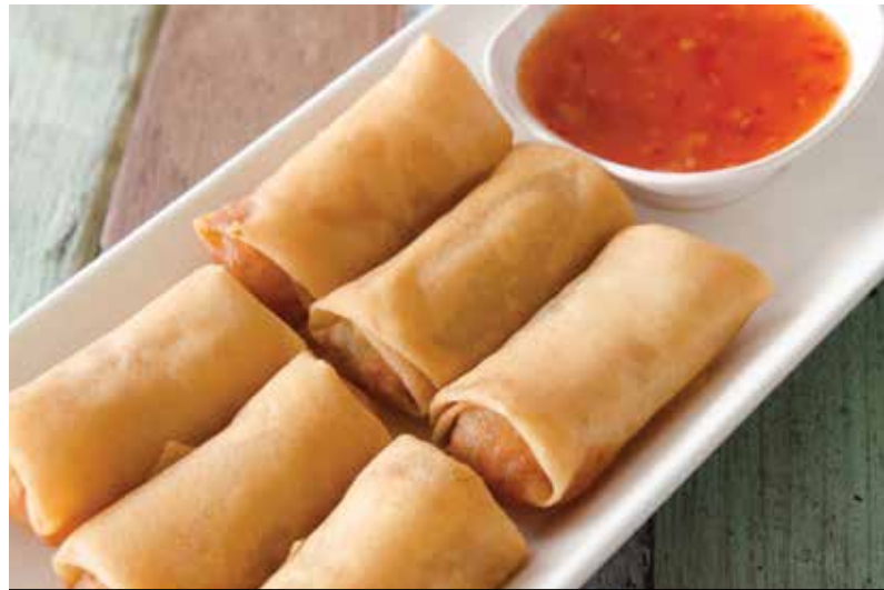
I1044 | Buffalo Chicken Spring Roll