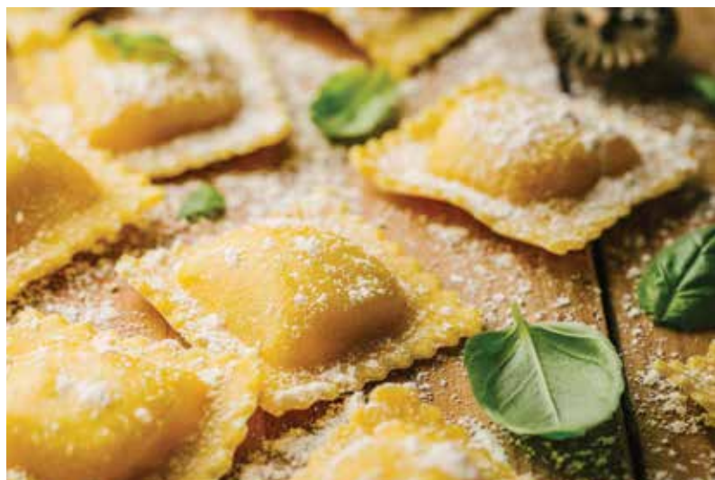
ML8621 | Short Rib and Aromatic Vegetable Ravioli