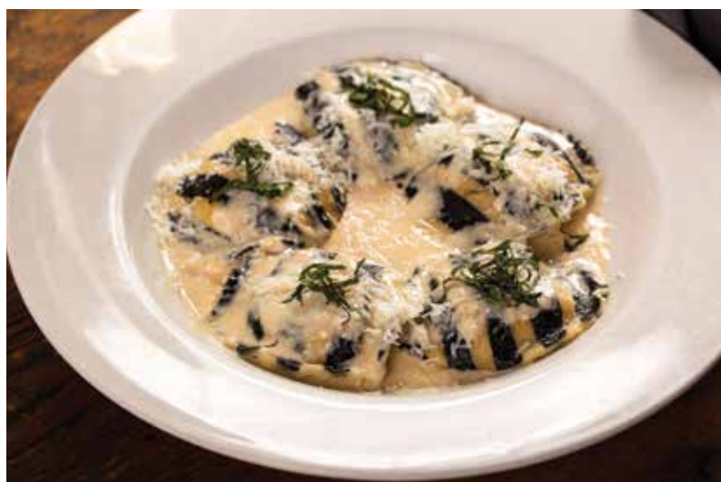
ML3209 | Maine Lobster Striped Ravioli

"I have to say the product is great and nothing but good feedback from our clients."