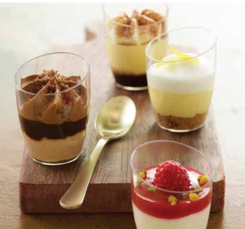
TP1205 | Mini Dessert Shooter Cup Assortment