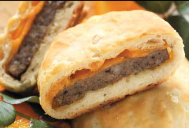
LB0008 | Biscuit Stuffed with Tennessee Sausage and Cheddar Cheese