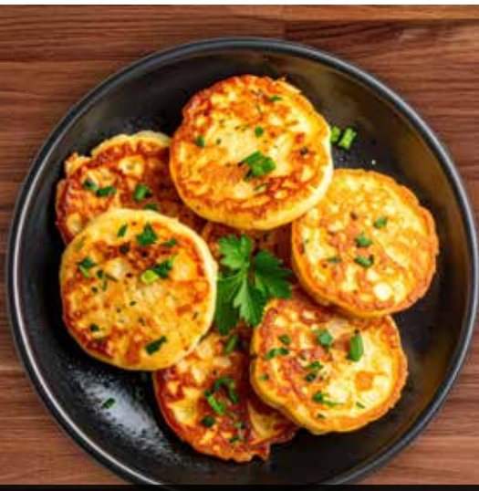
V2012 | Potato Pancakes