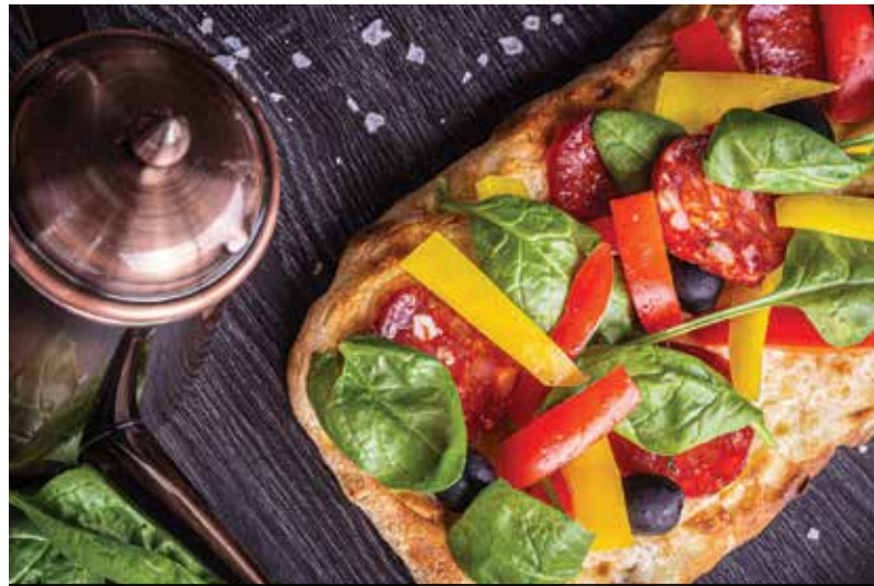
BG3119 | Flatbread Pizza Base (10" x 6")