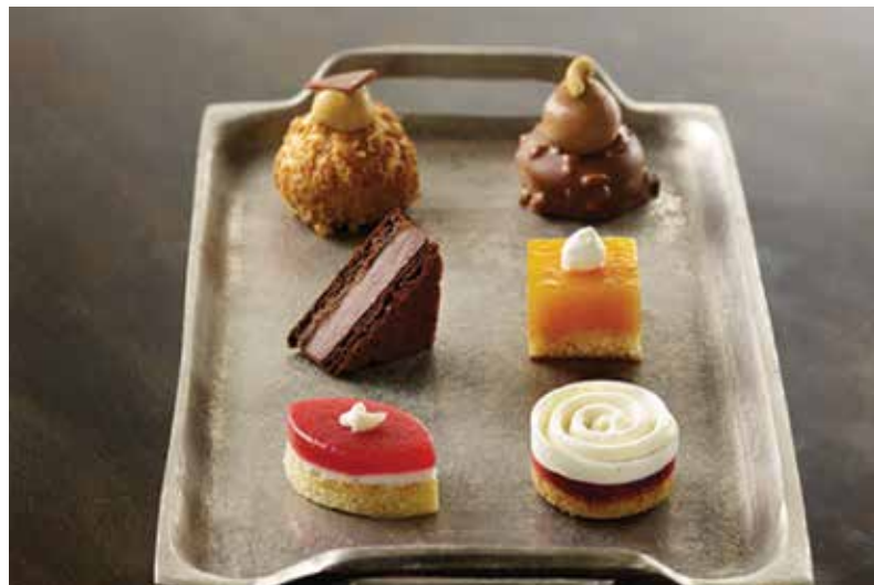
TP5597 | Art Deco Petit Four Assortment