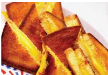
C1138 | Mini Grilled American Cheese Sandwich