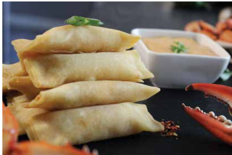
C4146 | Crab Cigar