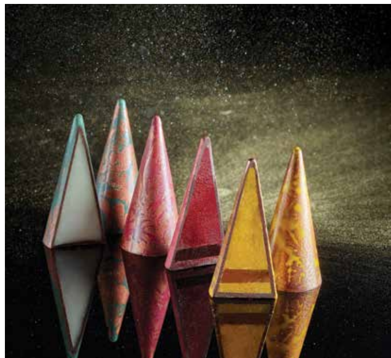
M9440 | Venetian Bonbon Assortment