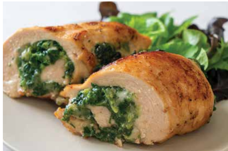
Y5004 | Chicken Florentine Roll