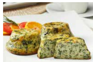
Y1016 | Crustless Quiche with Sautéed Spinach and Swiss