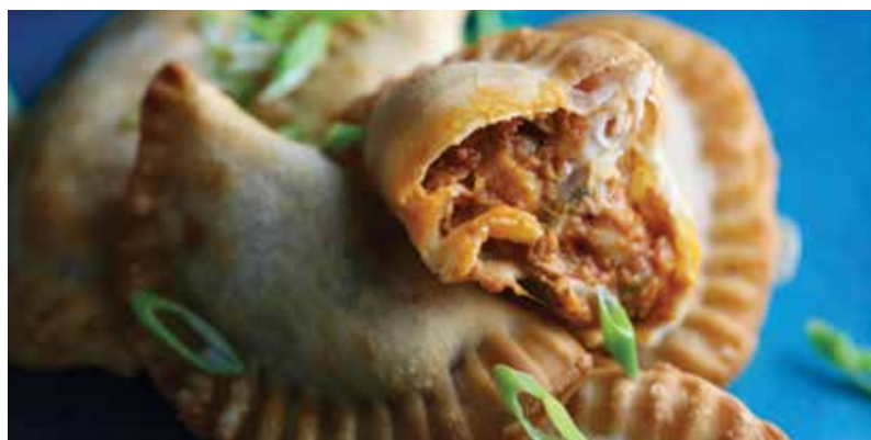
I1150 | Chorizo Empanada with Black Beans, Onions and Pepper Jack Cheese