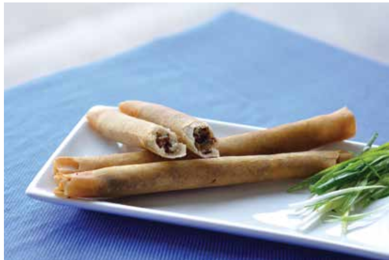
M9498 | Wild Mushroom Lumpia (1.4 oz.)