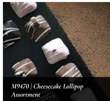
M9470 | Cheesecake Lollipop Assortment