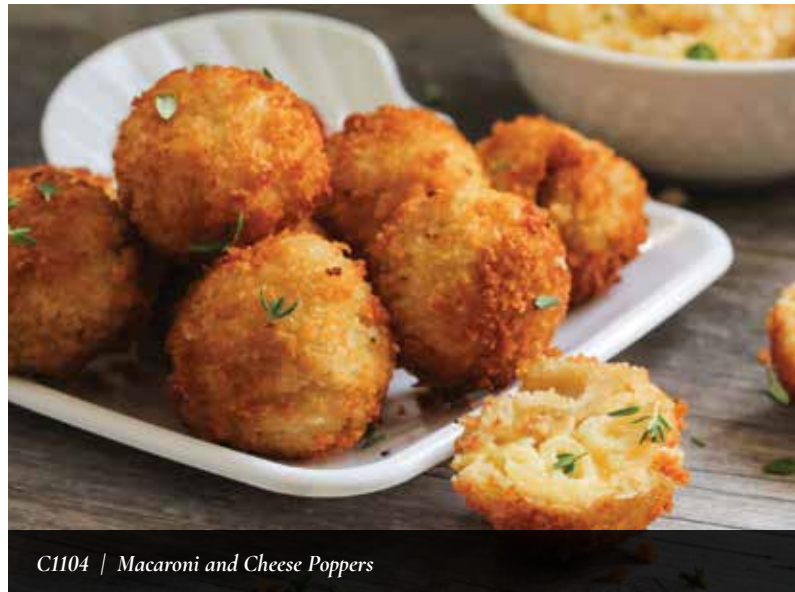
C1104 | Macaroni and Cheese Poppers