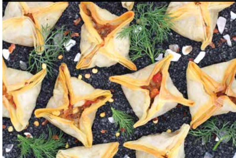
V2132 | Eggplant Caponata Phyllo Star

"I really appreciate the partnership you guys have shown us over the years. You have always gone above and beyond for us, and have definitely made me brand loyal to Gourmet Kitchen Inc."