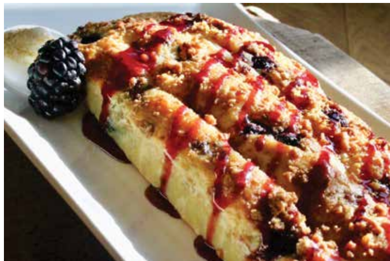
P2006 | Buttermilk Breakfast Tart Stuffed with Fresh Blueberries and Granola