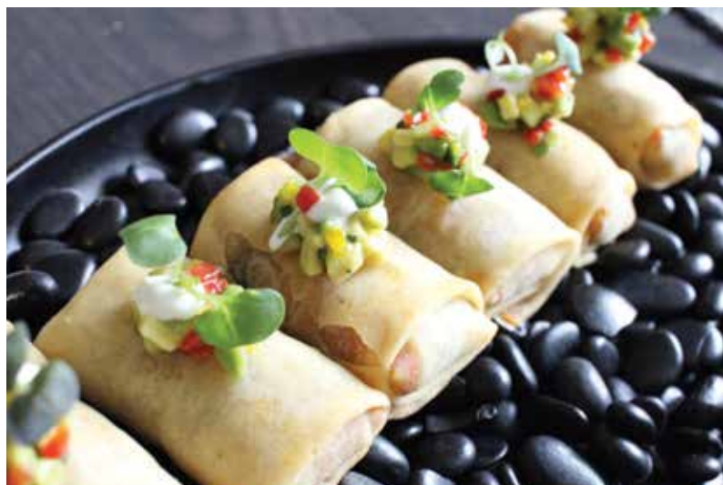
I1008 | Black Bean and Cheddar Spring Roll