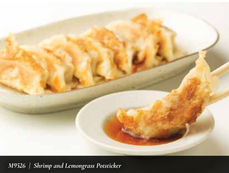
M9526 | Shrimp and Lemongrass Potsticker

“Everything has been great, people are loving the food and it cuts down on cook time. Well worth it!!! You guys rock!!!”