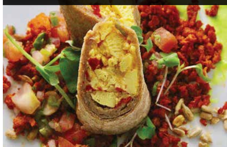
I1275 | Breakfast Burrito with Eggs, Cheese, Peppers, Onions in a Whole Wheat Tortilla