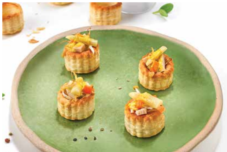
PD710 | 1.25" Puff Pastry Vol au Vent

"Thank you for all the help and timely response. You continue to provide reliably consistent high-quality products and service."