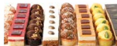
OPD110 | Mini Pastry Assortment