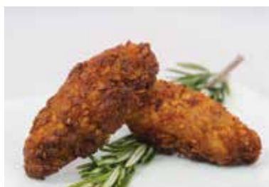
C2018 | Chicken Tender with Pecan and Maple Batter