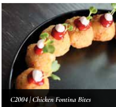
C2004 | Chicken Fontina Bites