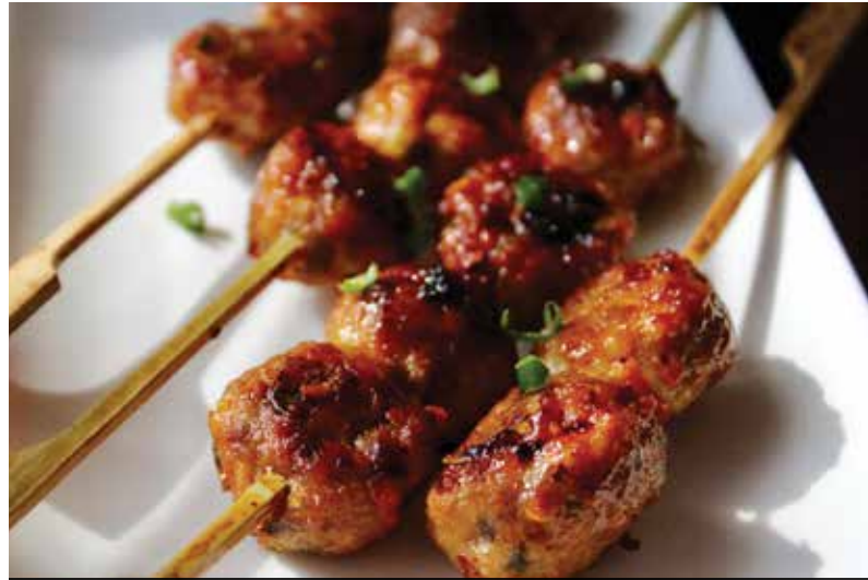
C2456 | Ginger Chicken Meatball Skewer