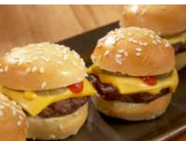
Y501 | Black Angus Mini Cheeseburgers