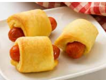
FH001 | Beef Franks in a Blanket