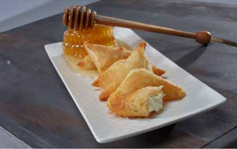
Y1006 | Goat Cheese and Honey Phyllo Triangle