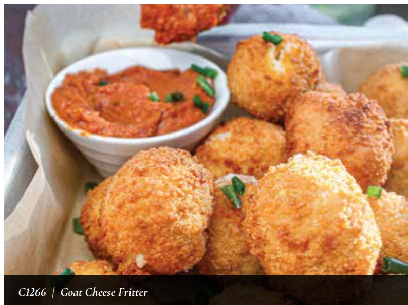
C1266 | Goat Cheese Fritter