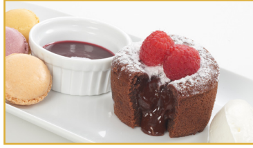
Lava Cake (3")