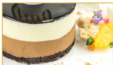
Trilogy Chocolate Cake (3") - Gluten Friendly Item # OPD102 | Case: 20