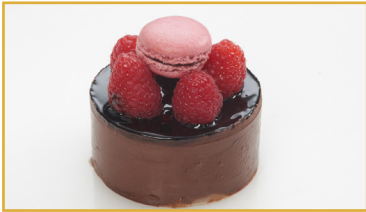
Marquis Au Chocolat (3")