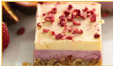
Raspberry and Passion Fruit Raw Cake (2.3 oz.) - Plant Based