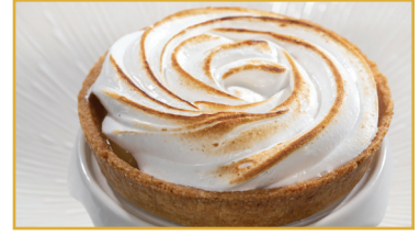
Lemon Meringue Tart (4")