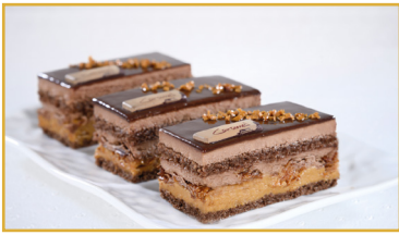
Chocolate Caramel Rectangle (3 oz.)