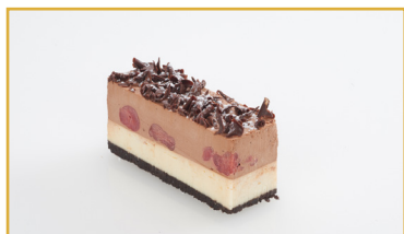
Forest Cheesecake (16" x 4") Item # DSP241 | Case: 2