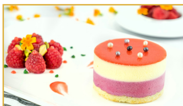
Red Berry Mascarpone Cake (3") - Gluten Friendly Item # OPD103 | Case: 20