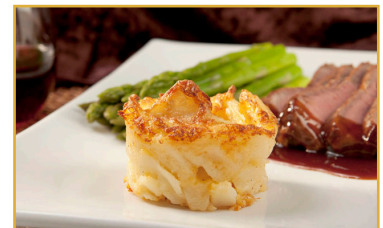
Potato Au Gratin Dauphinoise (4.15 oz.)