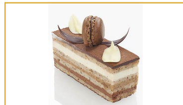
Marjolaine Strip (16" x 4") - Gluten Friendly Item # DSP164 | Case: 2