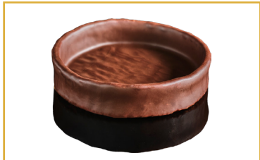
Dark Chocolate Round Shell (3") - Plant Based