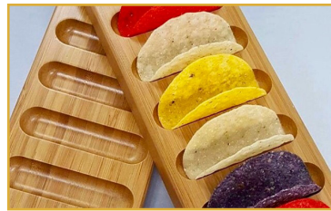
Assorted Mini Taco Shells