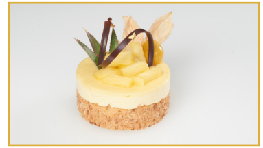
Exotic Cake (3")