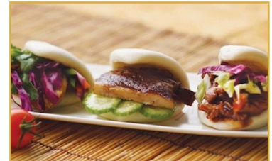
Empty Bao Buns