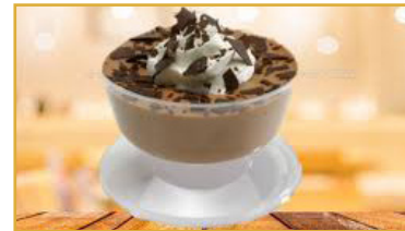
Belgian Chocolate Mousse Dessert Cup (3.5 oz.)