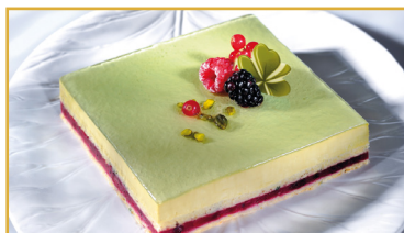
Pistachio & Red Fruit Half Sheet Cake (12" x 18") Item # DS2006 | Case: 1