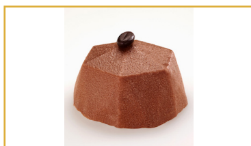
Colombian Cake (3") - Gluten Friendly Item # DSP028 | Case: 12