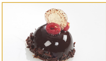
Dome Cake (3") - Gluten Friendly Item # DSP224 | Case: 12