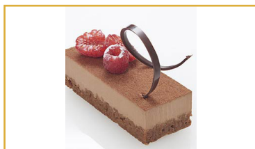
Chocolate Crunch Bar (12" x 4") Item # DSP140 | Case: 4