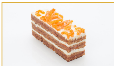
Carrot Cake Strip (16" x 4") Item # DSP163 | Case: 2