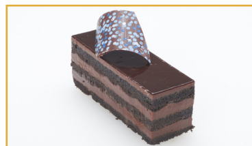
Dublin Strip (16" x 4") Item # DSP246ST | Case: 2