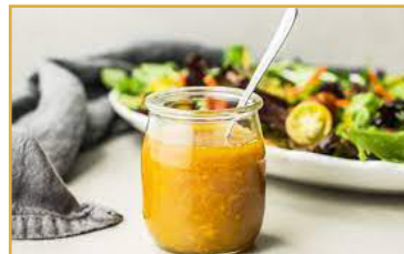
Orange Ginger Sauce