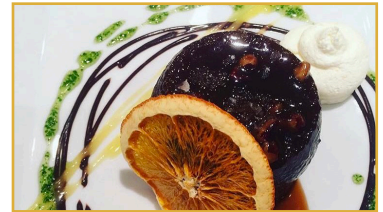
Sticky Toffee Pudding