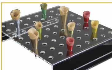
Acrylic Cone Stand (64 Slots)