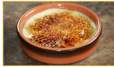
Crème Brulee in Ceramic Crocks (4 oz.)