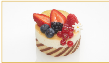
Vanilla Bourbon Cake (3")