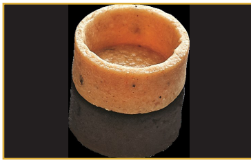
Mini Round Tart Shell