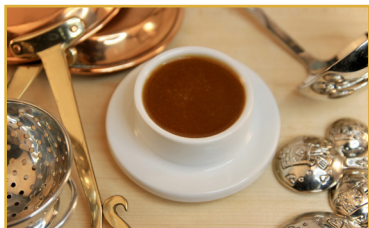
Demi Glace Sauce