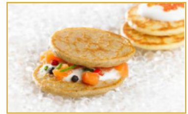
Blini's (.29 oz.)(2.36")