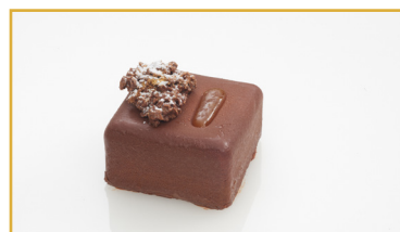
Caramelo Cake (3") - Gluten Friendly Item # DSP025 | Case: 12