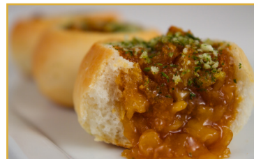
French Onion Soup Boules