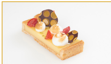
Lemon Tart (16" x 4") Item # DSP153 | Case: 2