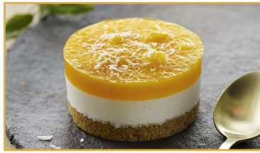
Coconut & Mango Shortbread (3 oz.)