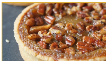
Pecan Tartlet (3") - Gluten Friendly Item # M9454 | Case: 72