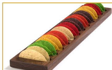
Hand Carved Taco Shell Board (12 Slots)