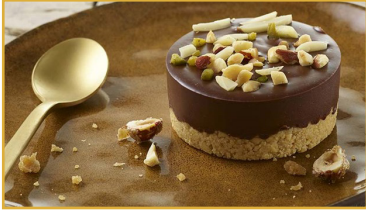
Gianduja Chocolate Tart (3 oz.)