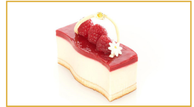
Raspberry & Vanilla Cheesecake (5.6 oz.)