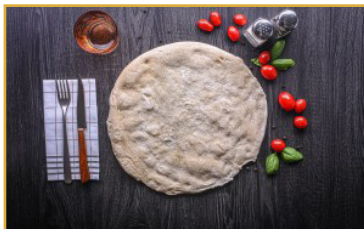
Gold Pizza Crust (13")