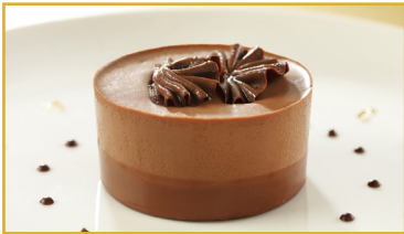
Truffon Cake (3 oz.)