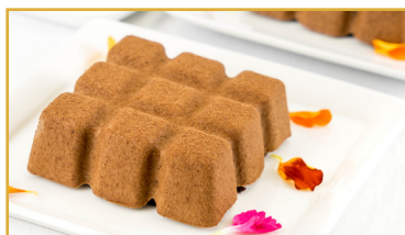
Chocolate Mousse Cake (3") - Plant Based & Gluten Friendly Item # OPD107 | Case: 20