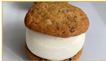
Chocolate Chip Cookie Ice Cream Sliders