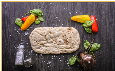
Flatbread Pizza Base (10" x 6")