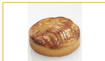
Apple Tartlet (3") Item # DSP218 | Case: 12