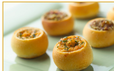
Lobster Bisque Boule