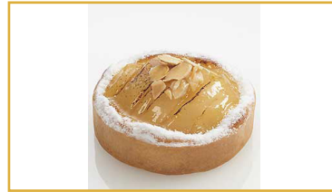
Pear Tart (3")