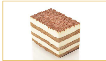
Tiramisu Rectangle (4.4 oz.)