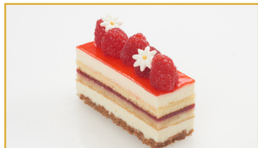
Edelweiss Strip (16" x 4") Item # DSP162 | Case: 2