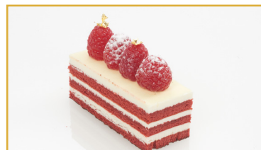
Red Velvet Strip (16" x 4") Item # DSP170 | Case: 2