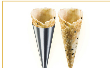
Mini Black Sesame Waffle Cone (3.14")