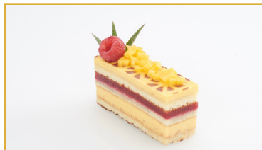
Equator Strip (16" x 4") Item # DSP157 | Case: 2