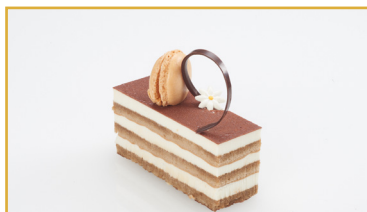
Tiramisu Strip (16" x 4") Item # DSP146 | Case: 2