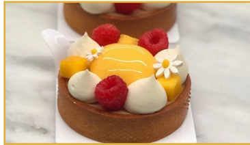
Passion Fruit Tartlet (3")