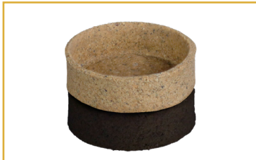
Neutral Tart Shell (2") - Plant Based, Gluten Friendly