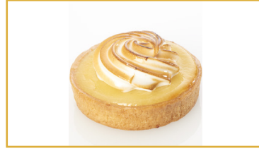
Lemon Meringue Tart (3")