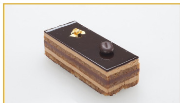
Opera Strip (12" x 4") Item # DSP125 | Case: 4