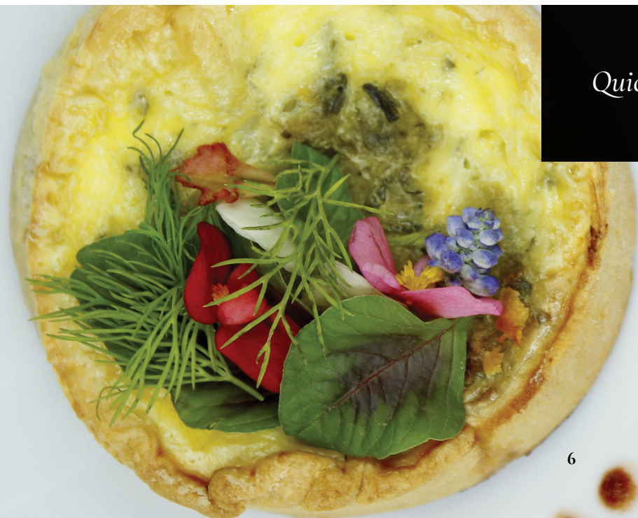
Quiche with Aged Gruyere and Leek | Q1047