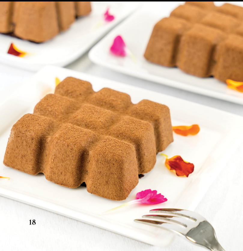
Vegan Chocolate Mousse Cake | OPD107