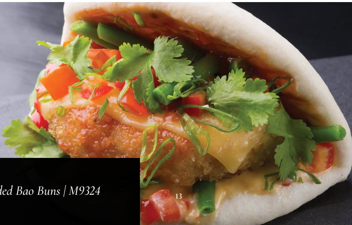
Plain Folded Bao Buns | M9324