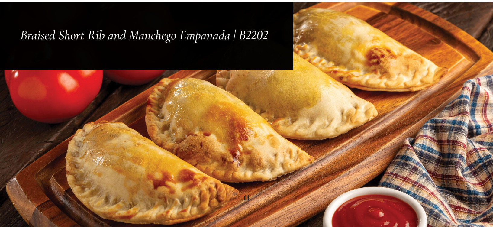
Braised Short Rib and Manchego Empanada | B2202