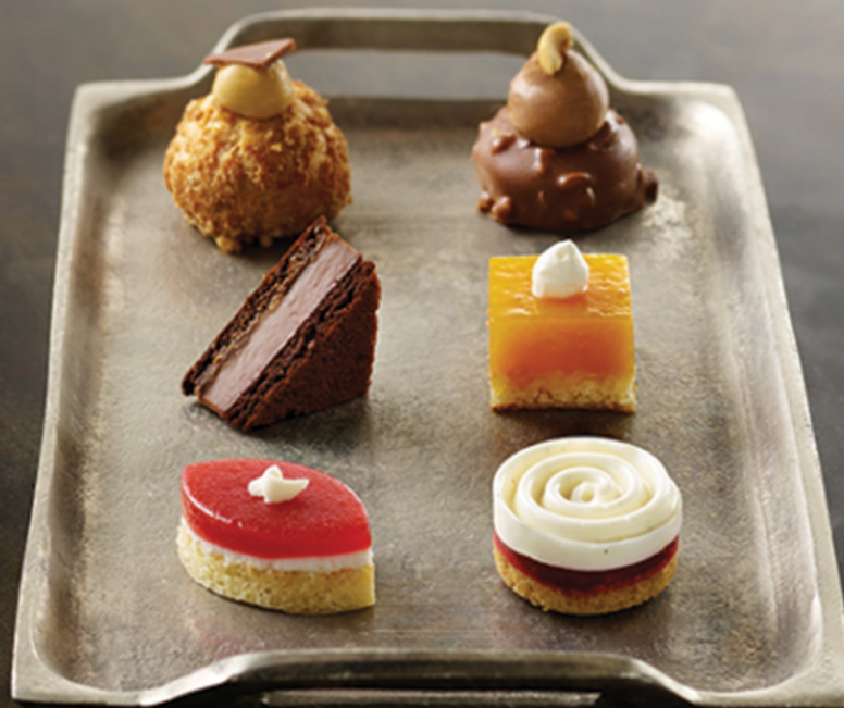
Art Deco Petit Four Assortment | TP5597