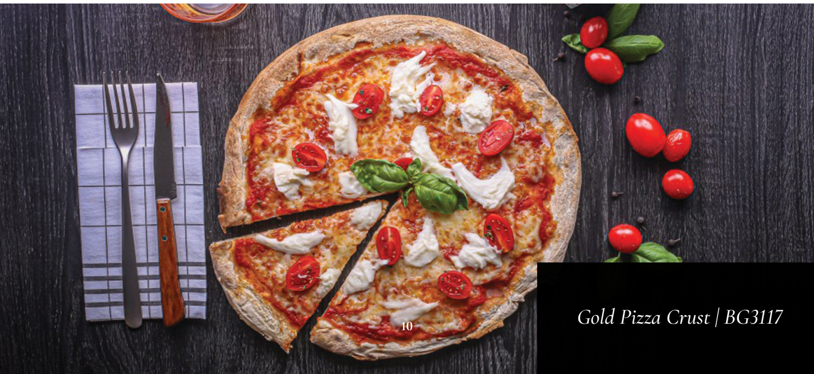
Gold Pizza Crust | BG3117