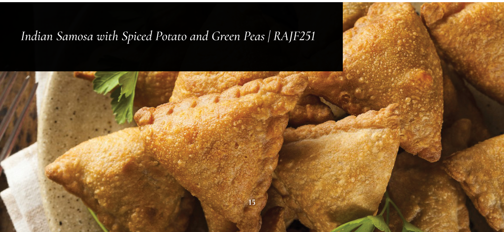
Indian Samosa with Spiced Potato and Green Peas | RAJF251